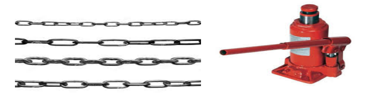
Fig(6.4 & 6.5): Jockey and Link chain