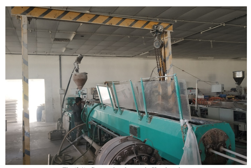
Fig (3.1): Conventional crane in Kundan pipes

In Kundan pipes, they are using mechanical crane for using changing and transmitting of die set to the store room. In that way it will take much time ,need more space and labours are required during changing die set that shown in below figure.