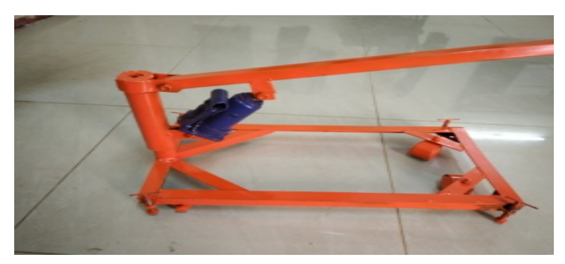
Fig (6.3): fabricated model of moveable hydraulic jockey

Visit: <u>www.ijirset.com</u> Vol. 8, Issue 3, March 2019