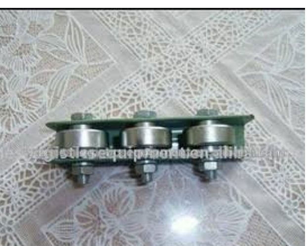
Fig( 6.1 & 6.2): wheel bearing